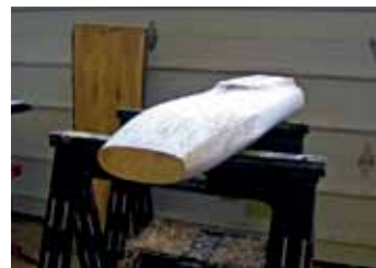
Basic shape Dennis has become handy with a chainsaw, using it to cut tree trunks or logs to the correct rough shape. The quality of the wood is, of course, critical to the success of the sculpture.

From tree trunk to art (in approximately four months)