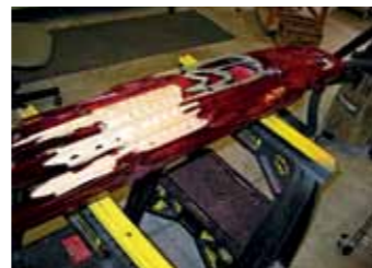
Adding the dye Dye rather than paint provides the finishing touch but that in itself is a black art, because the dye soaks away almost instantly, and is seen again only with the application of a clear fixer.