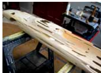
Assembling the pieces As the separate parts go together, Dennis also has to consider how the sculpture will be mounted. One work, 9ft long, cantilevers out from the wall, without visible supports.