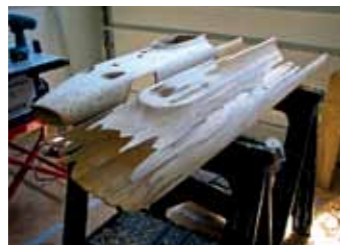
Hollowing out It can typically take 40 days to get to this stage, with the wood shaped and hollowed out. Dennis tries to minimise the number of pieces used to create the sculpture, to maximise impact.